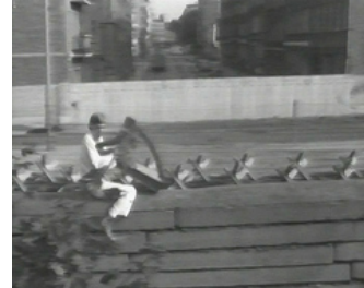
Wieland Speck, Berlin Off/On Wall , 1978, still from a black-and-white video, 22 minutes.

Heidestrasse 46, September 12–December 19