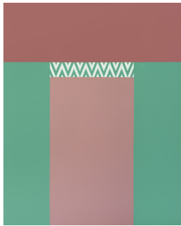
Glimpse , 2017. Acrylic on canvas, 178 x 142 cm

In the first part of East of the West , Jaray's paintings present themselves as vibrant abstractions of architectural patterns that through their singular plane, seemingly do not disclose their architectural reference within them. The painterly surface seems intangible, like a reflexive mirror in which the viewer becomes herself the reflection. Only one of the four exhibited paintings seems to break this surface flatness. In the painting Glimpse (2017) we are invited to look through the painting's interior frame to an architectural detail of a building that has been abstracted by the artist on previous occasion. Differently to the two other bold visualisations of the same architectural and deeply Viennese pattern, the zig-zag shape of the tiled roof pattern of Vienna's Stephansdom cathedral, Glimpse barely reveals its view onto an almost hidden detail within an otherwise bold graphic frame.