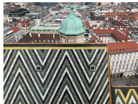
Roof of Stephansdom.

Investigating architectural structures and ornamental patterns has been at the core of Jaray's practice since the 1950s. A building's particular structural rhythm remains a core inspiration and driving force for the artist's visual translation into painterly abstraction. Yet Jaray's perception of architecture frees its specific form from its contextual site and elevates it towards a universal moment of autonomous perception. With the exhibition East of the West , Jaray returns to her city of birth, presenting a selection of works from different periods of her oeuvre in two spatially separated locations. The exhibition's title refers to Jaray's specific biography as well as to Vienna's geopolitical location as a consequence of historical events.