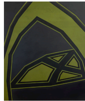
St Stephen's Way II , 1965. Oil on canvas, 180 x 152 cm

upon which a mirroring or reflection appears. Depth of field is included within the works, making them architectural renderings themselves; when viewed in this light these 1964 works are less about radical surface and abstraction. On the contrary, they are rather painterly references to architectural perception focusing on reflections and internal mirroring as evidenced by the embedded pictorial plane in the form of a particular horizon line. Though most horizontal lines are uneven and distorted, seemingly making it difficult to maintain balance. Again, when viewed in context to Jaray's biography, the works can reveal an internal longing for grounding, being on one hand abstraction of architectural detail and on the other a metaphorical search for belonging.